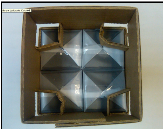
H20 Series ( 400 per cardboard sleeve)