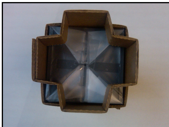
H44 Series (50 parts per cardboard sleeve)